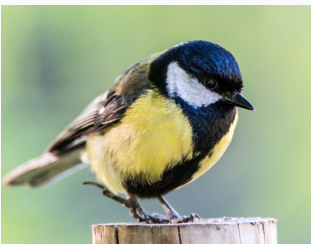
CHICKADEES Poecile spp.