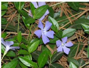
PERIWINKLE Vinca major