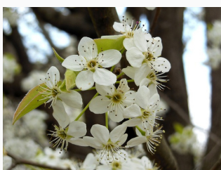
BRADFORD PEAR Pyrus calleryana