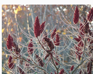
SUMAC Rhus spp.